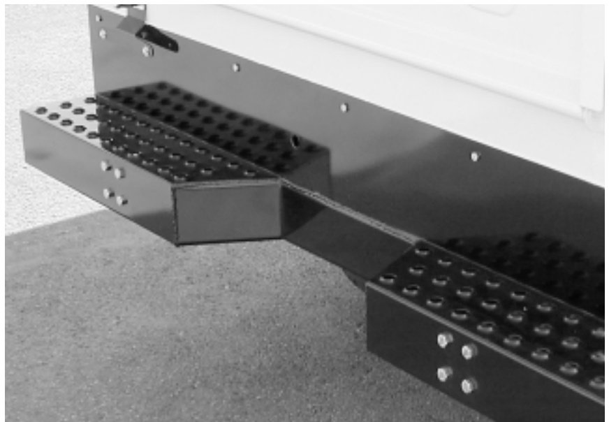
Reading's new pooched bumper